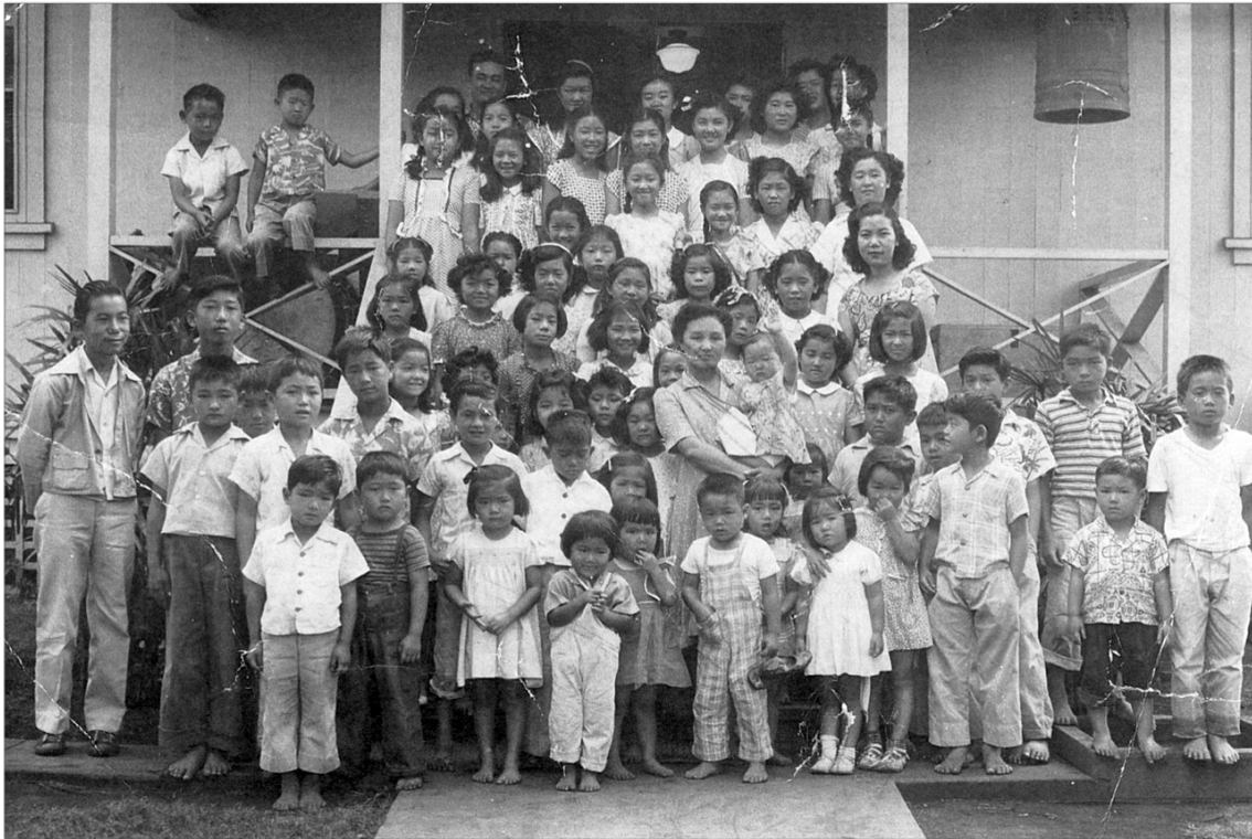
Buddhist Hongwangi