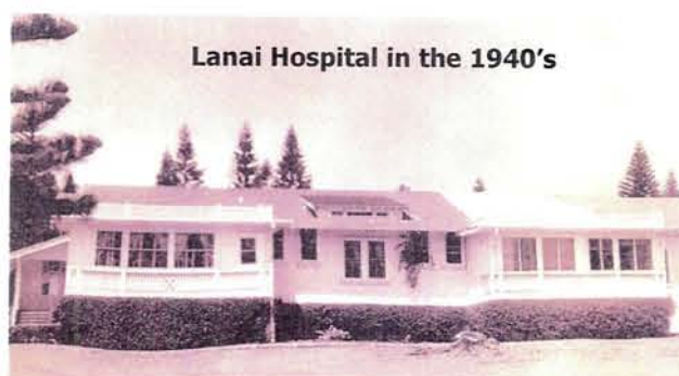
Lanai Hospital in the 1940's