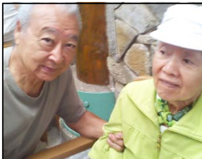
Photos from the Class of 1952 Meeting, August 15, 2012.