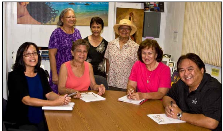
Photos taken at a board meeting held on August 8, 2012