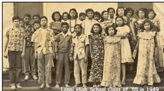
Lanai High School Class of '55 in 1949