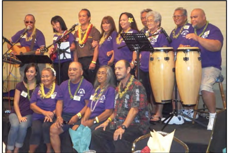
The Dalde and Garalde Clan